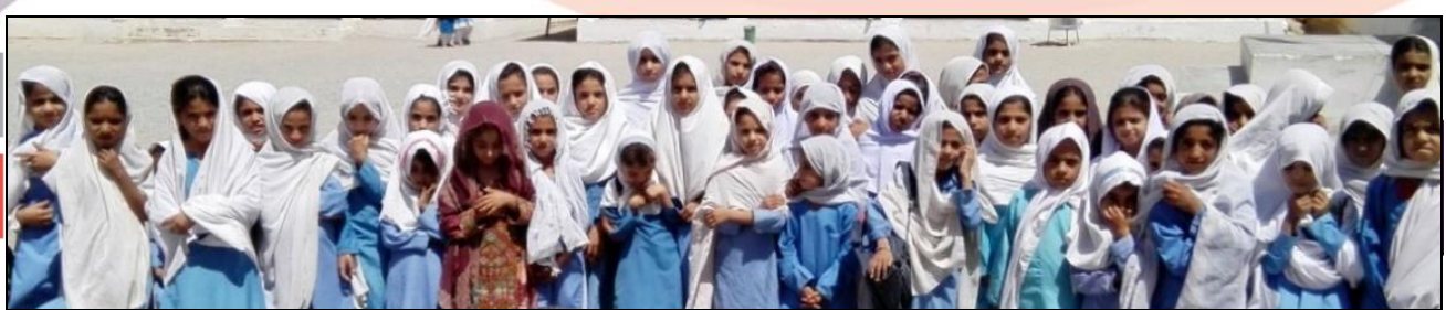
Good Governance in Education through Communication and Networking Tools